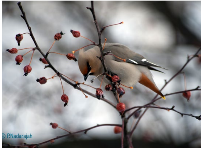
Frequently found in the Ottawa region, the Bohemian Waxwing can be very tame in winter in search of food.

"Marking glass so that it's visible to birds is the best way to prevent collisions. The first and most effective approach is applying a pattern – in either a ceramic FRIT or film to non-reflecting glass," Jason-Emery explained. "The frit and acid-etched patterns can range from