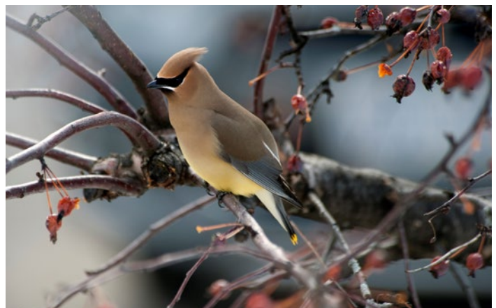
Regional songbird, the melodious cedar waxwing.