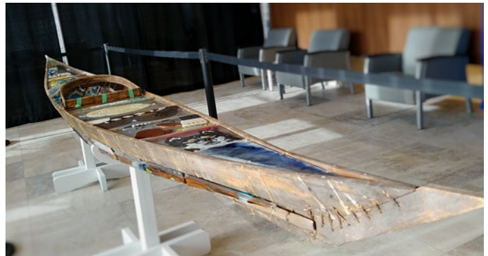
The Sivuniksattinu Qajaq art installation at The Ottawa Hospital's General Campus, created by Tungasuvvingat Inuit artists, is an example of the kind of visual representation for Indigenous Peoples that could be woven throughout the new Civic.