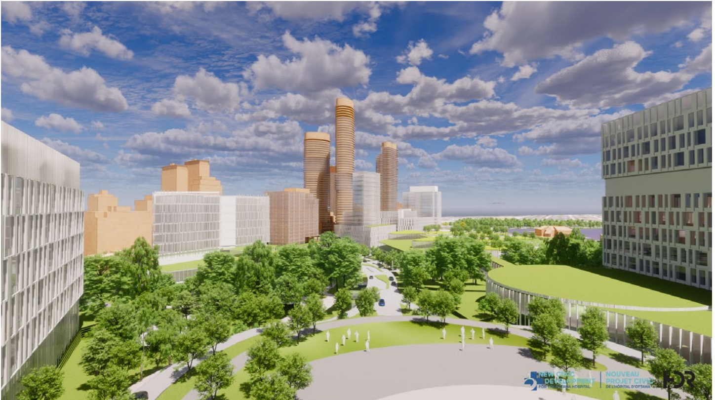
View from the new Civic development's main entrance.

construction begins in 2024 helps create efficiency for the project as a whole, added Mitch. "Finishing the garage before the main project means we can accommodate the trades workforce's need for parking while building the new hospital." The Ottawa Hospital plans to use the revenue generated from the new parking structure as a source of funds to contribute to its financial portion of the new facility.